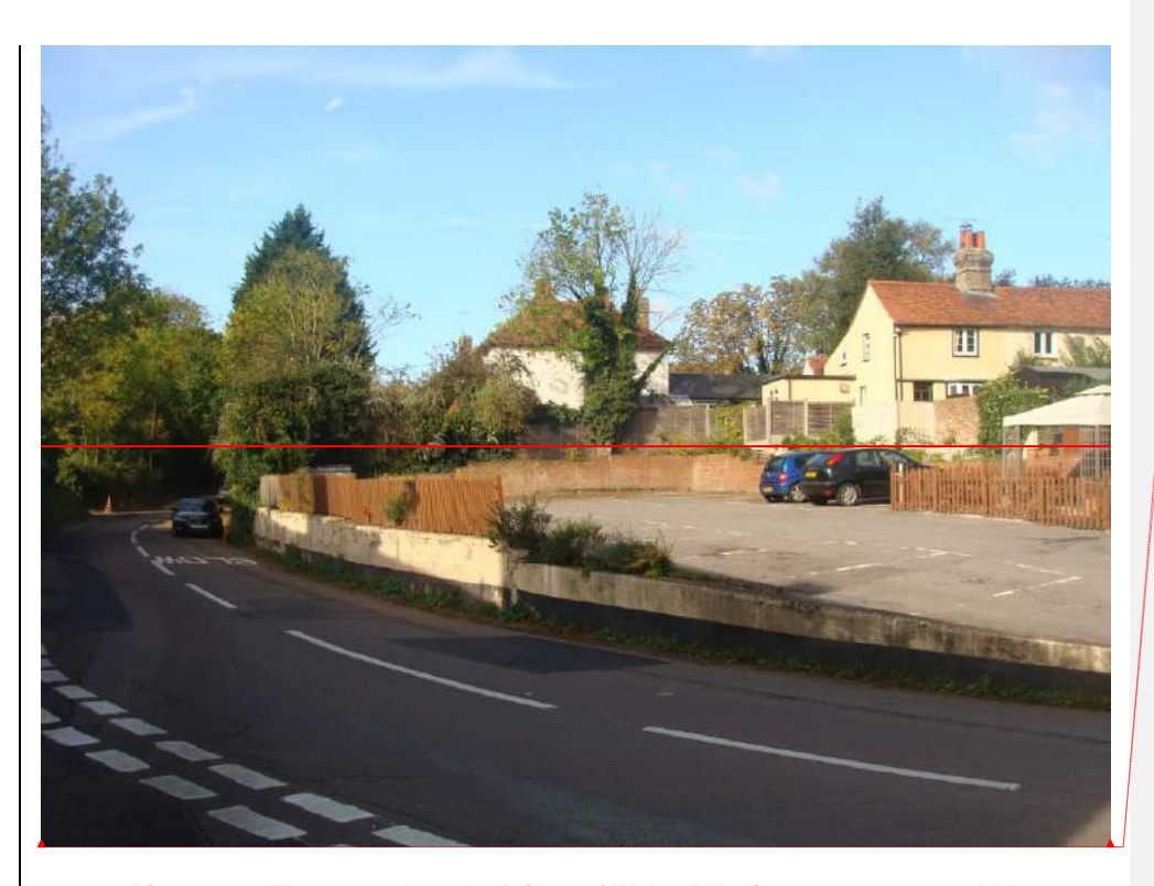
Picture 23 - The car park to the Prince of Wales PH - its appearance could be improved by comprehensive landscaping.

6.52. Fence around Amores. Amores is an important grade II* listed building and the many trees in its extensive grounds greatly contribute to the quality of the centre of the Conservation Area. Parts of the boundary fencing have recently been replaced, however other lengths remain in a deteriorating and unattractive condition. The west elevation to 'Amores' detracts in part and is in need of repainting.