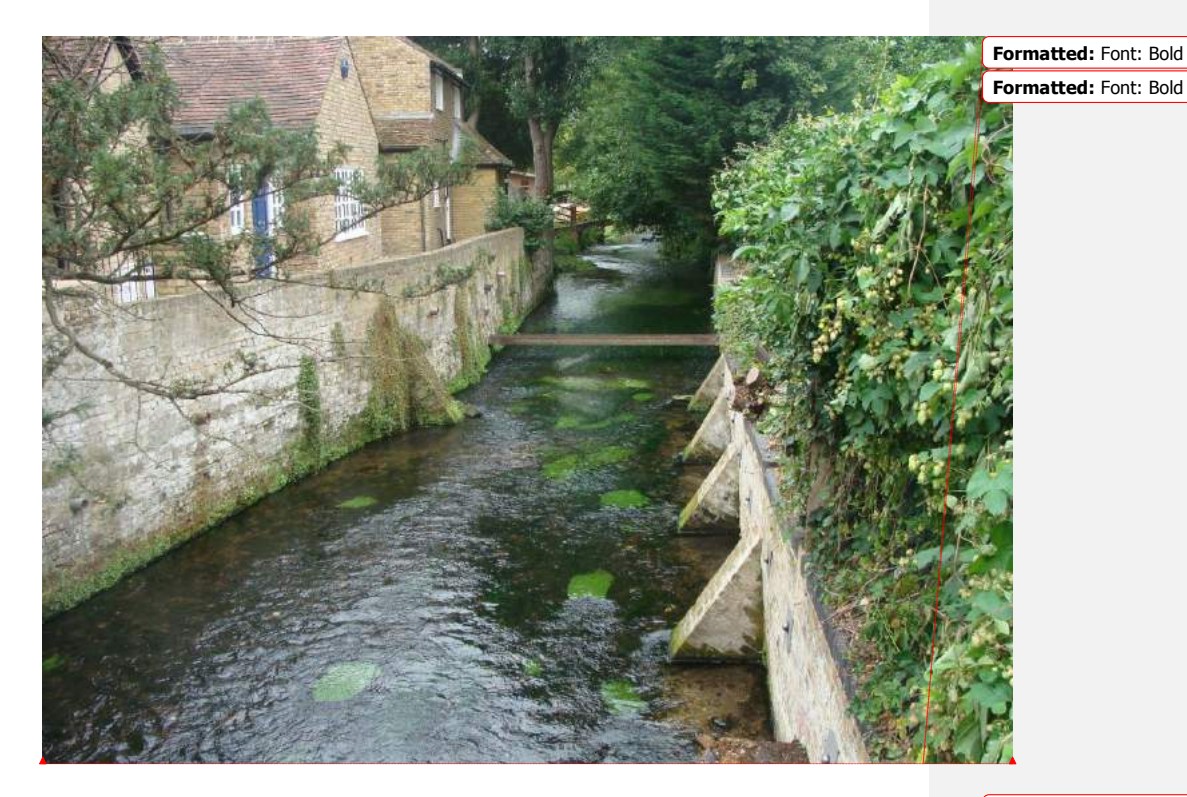
Picture 2018 – The River Mimram makes a particularly valuable visual contribution to the Conservation Area.