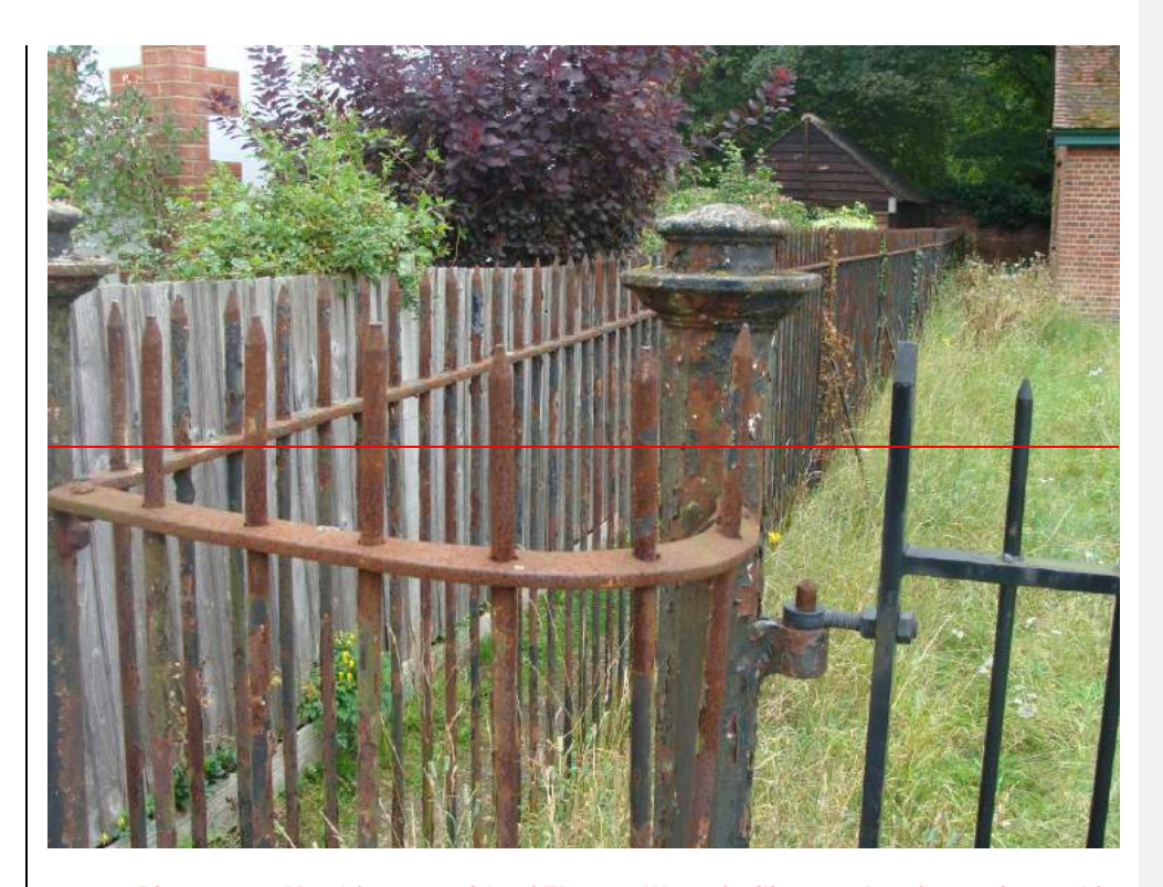
Picture 16 – Metal fence to side of Thames Water facility, worthy of retention and in need of repainting.

6.34. Wall forming north boundary to 'Stoneyf-Field'. A yellow stock brick wall, probably 20<sup>th</sup> century, of various height averaging about 2m, protected in law from demolition without prior consent. The wall makes an important contribution to the street scene in this location. which is in contrast with the deteriorating fencing surrounding 'Amores' opposite.