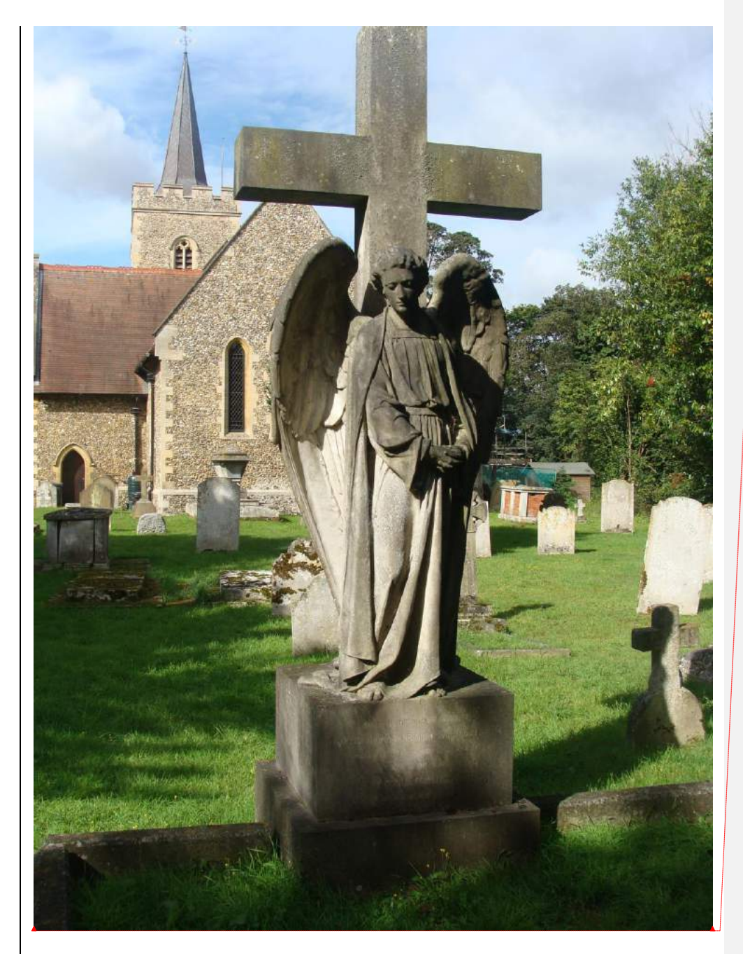
Picture 249 – St Mary's churchyard. This open space is of the highest quality in terms of its open space, ecology and quality tombs. This Appraisal recommends repairs be carried out to selected tombs, possibly in association with external funding.