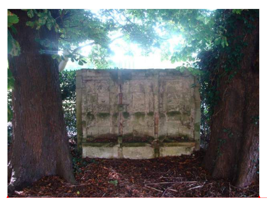
Picture 43 – 14<sup>th</sup> century grade II Sedilia removed from church during 19<sup>th</sup> century 'restoration', now in need of urgent repairs. Included on the Council's <u>BuildingsHeritage</u> at Risk Register.

6.8. Sedilia, St Mary's churchyard- Grade II. This sedilia. dating from the 14<sup>th</sup> century was removed from the church during its restoration and rebuilding in 1891. In a decorated Gothic style with stone seats and recessed bays, it is now badly eroded. The structure is identified as being 'At Risk' on East Herts BuildingsHeritage -at Risk Register. Careful restoration and consolidation is required and its long term protection from further erosion might involve returning it to the church interior or providing a proper shelter in its external location. Ongoing deterioration continues, which if remaining unresolved, will lead to its eventual destruction.