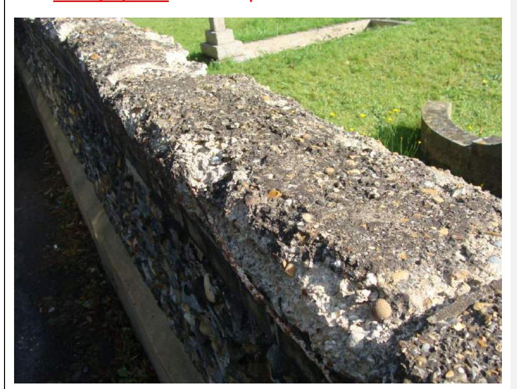
Picture 132 – Concrete capping slabs to church boundary wall. Picture retained as an historic record. These degraded capping slabs have now been replaced. in need of replacement.

6.28. Other distinctive features that make an important architectural or historic contribution. Wall forming boundary to churchyard and Hertingfordbury Road. 1.2 m flint and brick wall with entrance gates, probably of late 19<sup>th</sup>/early 20<sup>th</sup> century date. Concrete capping slabs, some recently replaced in need of replacement.