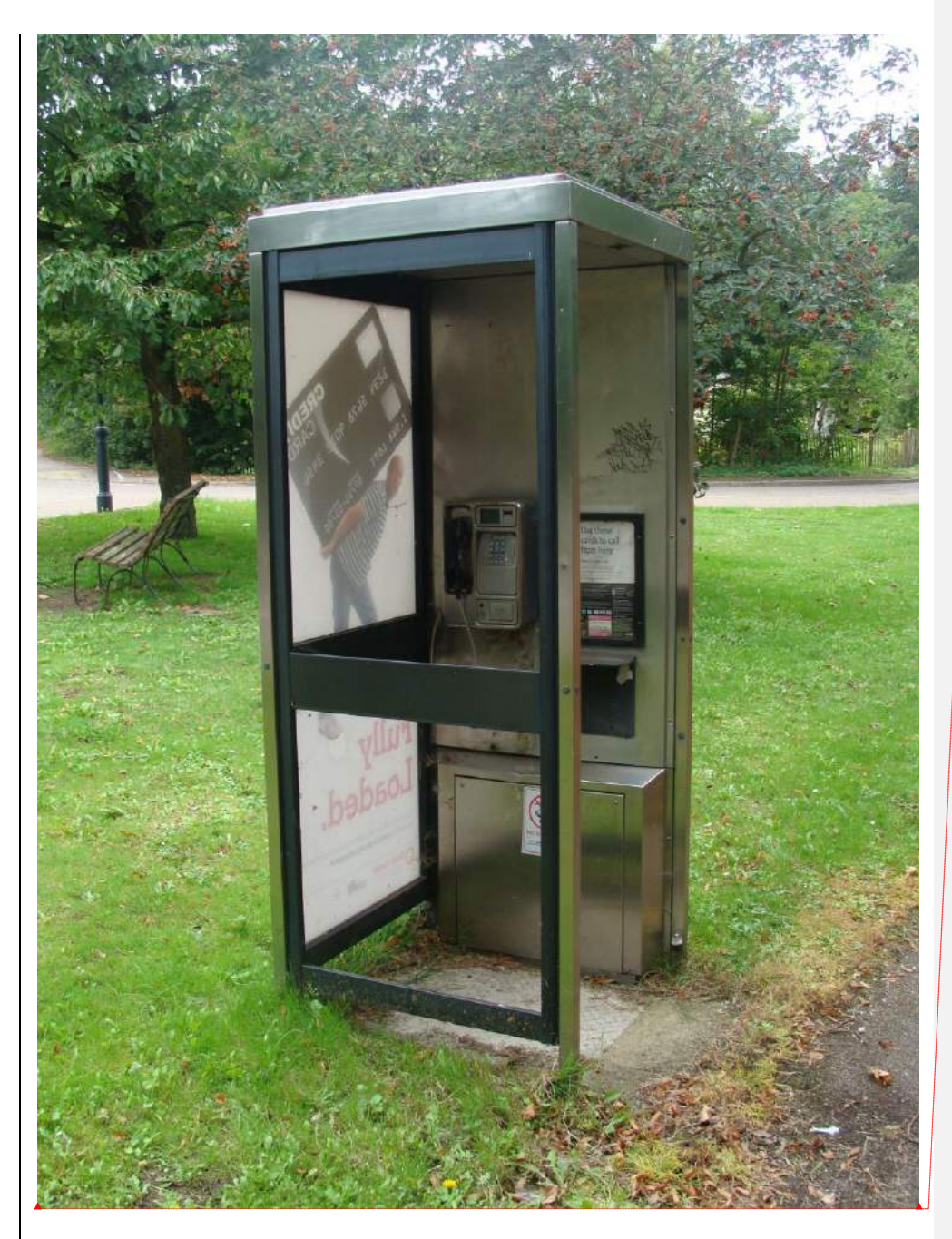
Picture 251 – Modern telephone box that should either be repaired or removed.

Formatted: Font: Bold Formatted: Font: Bold