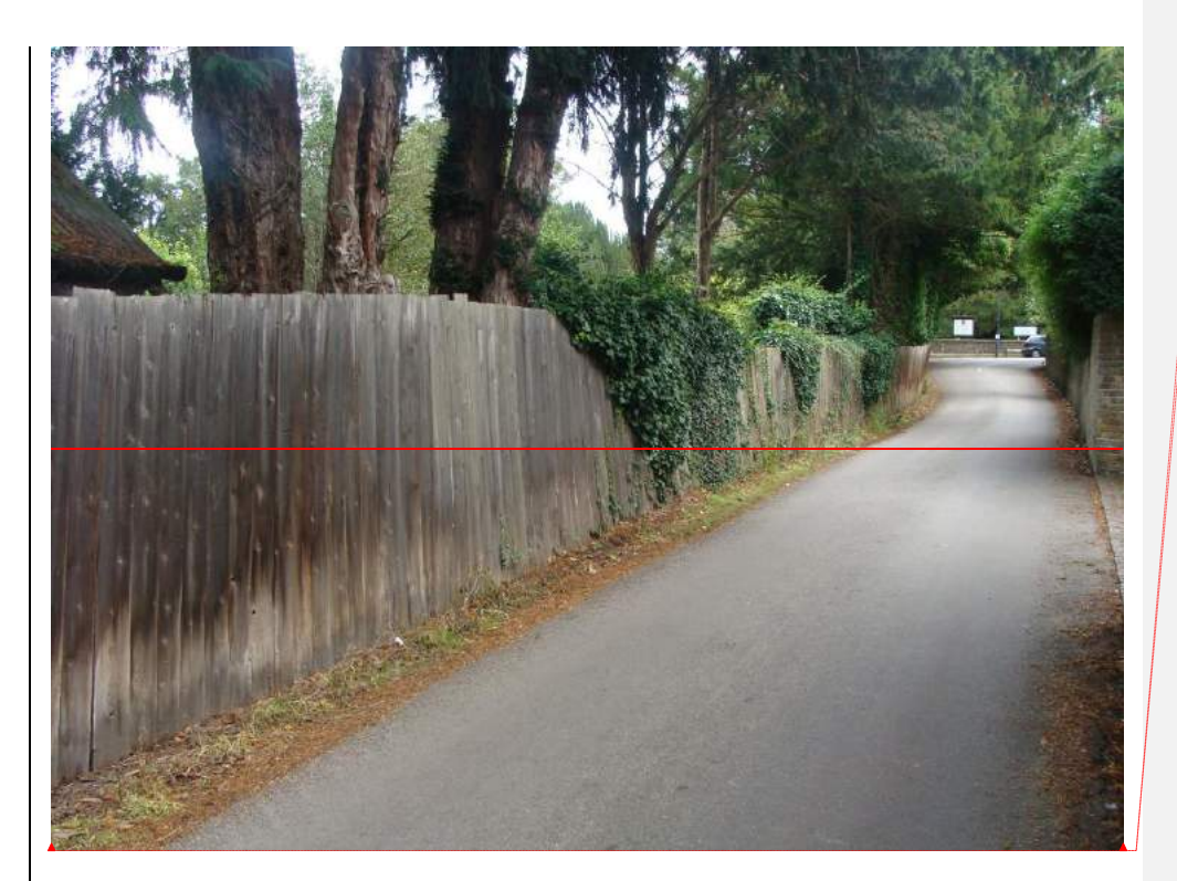
Picture 24 – Boundary fencing to 'Amores' that detracts from this important central location.

6.532. Telephone kiosk on northern approach. This modern telephone call box is in poor condition with some elements missing including door and one elevation. Some graffiti is evident. It is suggested that BT contacted to ascertain its current use. If the view is taken that it should be retained then the necessary repair works need undertaking. If on the other hand it is considered redundant, the call box should be removed.