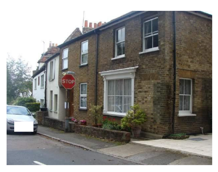
Picture 98 - No. 267 Hertingfordbury Road and nos. 1- 3 St. Mary's Lane. Unlisted buildings whose mass and selected architectural details contribute to the quality of the street scene.

6.24. Mill Farm, Hertingfordbury Road. A tall 2 storey late 19<sup>th</sup> century house of yellow stock brick and tiled roof. Several quality chimneys and many original windows. Rubbed brick lintels and date plaque 1892. Selected features are worthy of protection by Article 4 Direction subject to further consideration and notification.